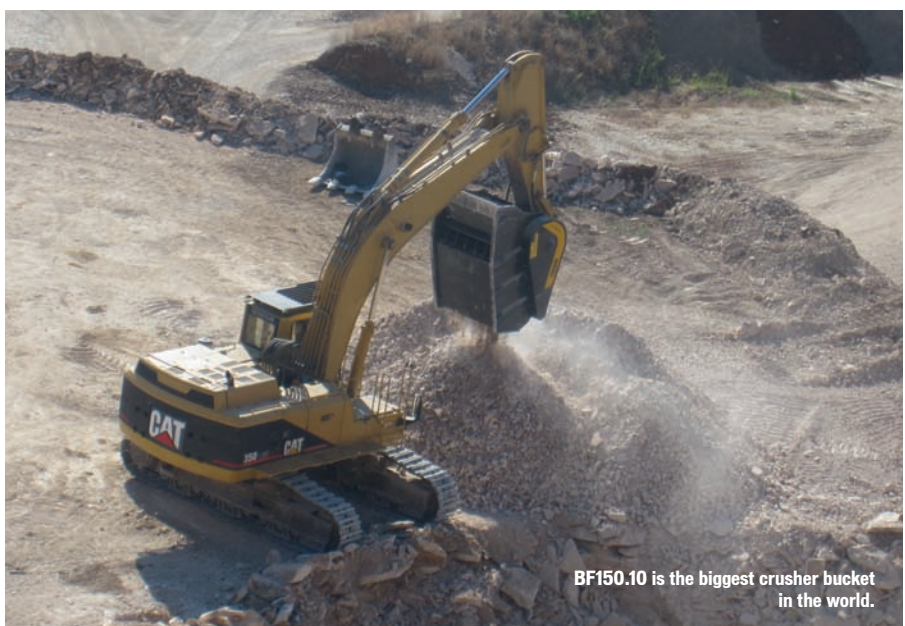
BF150.10 is the biggest crusher bucket in the world.

MB Screening and crushing buckets have been used in many pipelines projects, since they can simplify the working process, eliminating costs